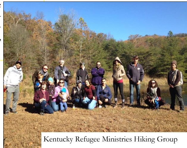
Kentucky Refugee Ministries Hiking Group

The National Partnership for Community Training is a program of Gulf Coast Jewish Family & Community Services. NPCT is a training and technical assistance program which supports refugee resettlement workers and service providers through national capacity building and collaborative efforts. For more information on this document and for research purposes, please contact partnership@gcjfcs.org or (305) 349-1220. Gulf Coast Jewish Family and Community Services received $225,000 in funding through the U.S. Department of Health and Human Services, Administration for Children and Families, Grant #90XR0027. The project was financed with 97% of Federal funds and 3% by non-governmental sources. The contents of this resource are solely the responsibility of the authors and do not necessarily represent the official views of the U.S. Department of Health and Human Services, Administration for Children and Families.